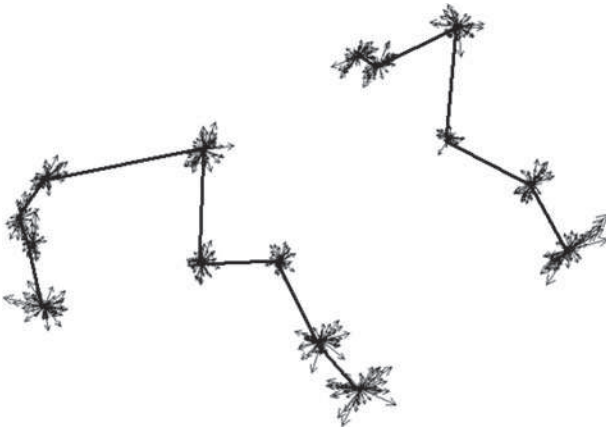
Figure 4. Vector plot. Straight lines show the consensus figure. See also Figure 1.

therefore general body curvature, was preserved. So, general and regional profiles (“silhouette”) can still be visually discriminative sexual traits for horse breeds. This is why expressions in an official description such as “crest is moderately lean in mares but inclined to be more full in stallions” have sense only for a morphological description based on silhouette. Another problem is that these are empiric definitions that are moreover implicitly meshed with colloquial meanings of the same terms. The result is an imprecise and ineffective description and unclear communication for comparative studies between sexes, subpopulations or other breeds.