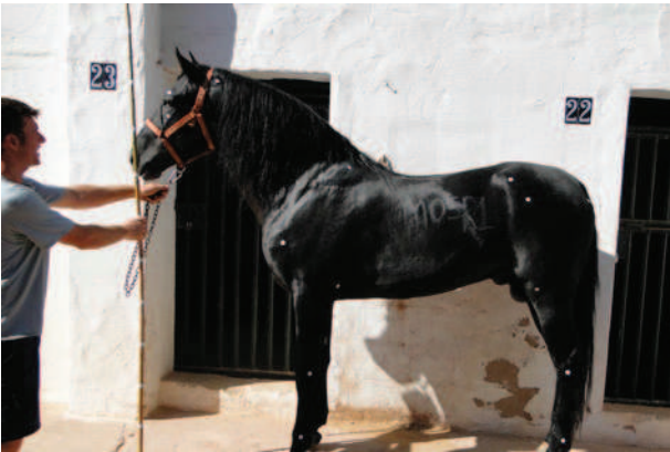
Figure 1. Landmarks digitized on the surface of the body. These 15 landmarks were chosen to provide an adequate coverage of the body functionality.

( 3\,456 \times 2\,304 pixels), from a distance to ensure that the animal only occupied the central portion of focal space to avoid peripheral image distortion or parallax. The images were then digitized using TpsDig software version 2.16 (Rohlf, 2010) to obtain the x , y coordinates of the landmarks. To ensure that the localization of the selected points, a Mantel test gave a R = 0.356 , P = 0 . So, the error for digitizing landmarks was considered negligible. To test whether the shape variation was small enough to permit the use of approximations in tangent space, a correlation between specimen distances in tangent space and Procrustes space was performed in TpsSmall (Rohlf, 2003). The correlation was very high ( r = 1 ), indicating that no significant distortion was introduced by tangent space approximations.