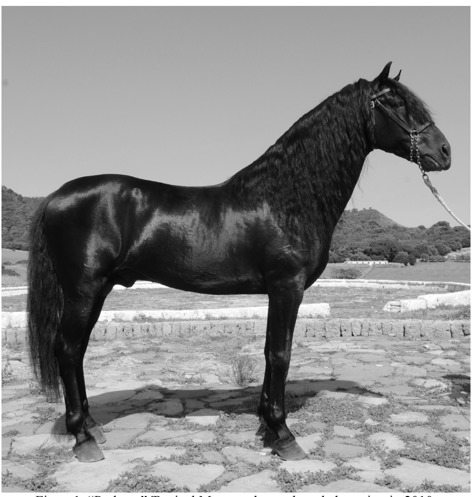
Figure 1. "Puderos" Typical Menorca horse, breed champion in 2010.

The Menorca horse breed (PRMe, Figure 1), traditionally known as "Caballo de Menorca", is an autochthonous equine breed of the Balearic Islands. The Stud-Book was opened in 1988 (Marqués, 2001), but the origin of the breed is unclear and poorly studied, although the PRMe breed and the endangered Mallorca horse breed are related to the Spanish Celtic horse breeds (Cañon et al. 2000). The PRMe was recognized as an endangered horse breed by its small census (Azor et al. 2007). They are mainly located in the Menorca Island (Spain), but currently, they are also found in the different autonomous regions of Spain, and even in several countries of the European Union, such as France, Italy and the Netherlands. The PRMe horse is black-coated and suitable for riding, and is well-known for its role during the traditional festivities on the island of Menorca called " Jaleo Menorquín ". In these festivities, the horses have to move with easiness and carry out the traditional movements among crowds of people. The regularity of the movements is slightly modified by the speed.